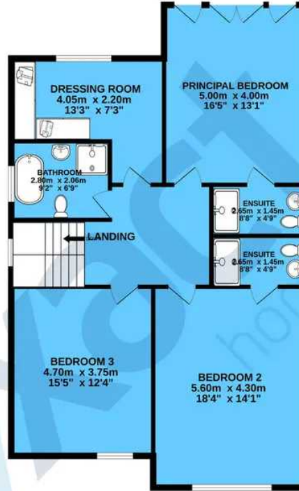
1ST FLOOR 101.3 sq.m. (1091 sq.ft.) approx.