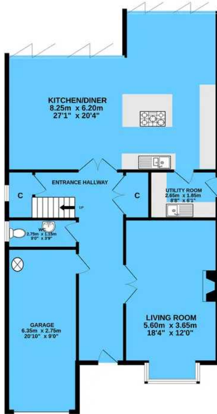
GROUND FLOOR 111.3 sq.m. (1198 sq.ft.) approx.