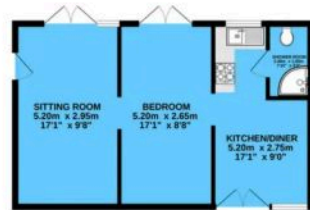
ANNEXE 44.9 sq.m. (483 sq.ft.) approx.