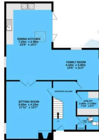
GROUND FLOOR 84.5 sq.m. (910 sq.ft.) approx.