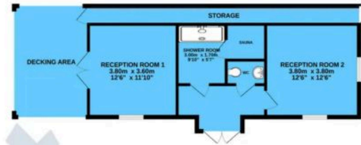
LOG CABIN 71.2 sq.m. (766 sq.ft.) approx.