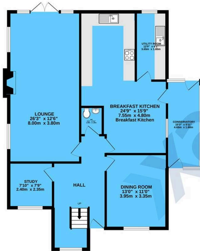
GROUND FLOOR 1121 sq.ft. (104.2 sq.m.) approx.