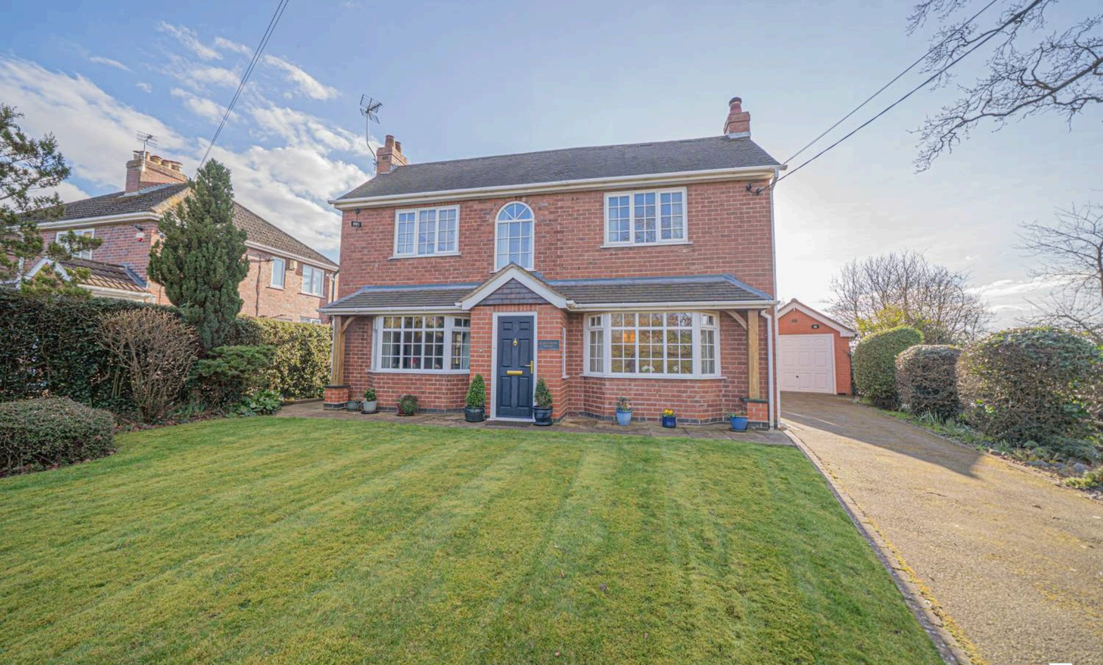
Benton Green Lane, Berkswell £750,000