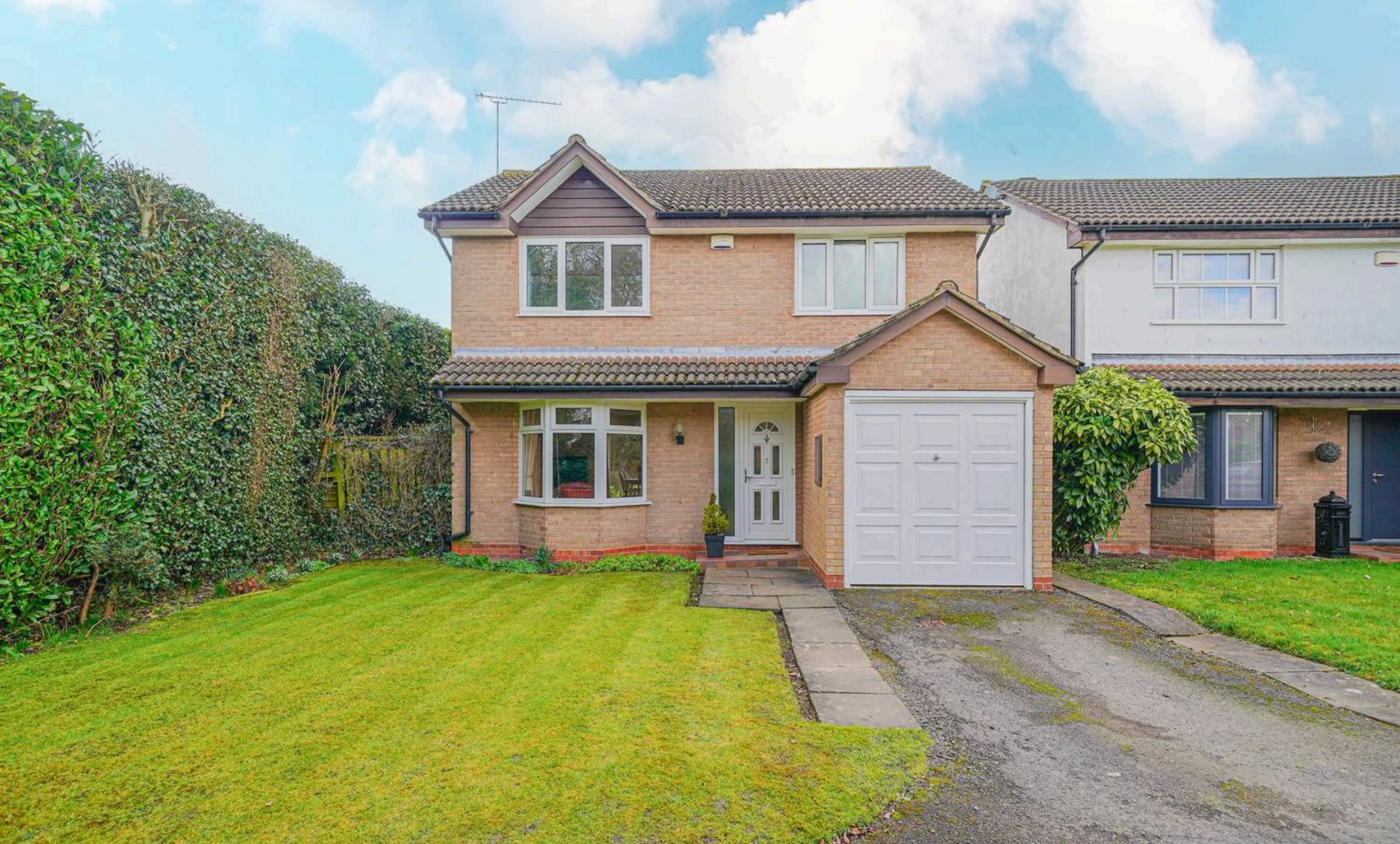
Newhouse Croft, Balsall Common £500,000