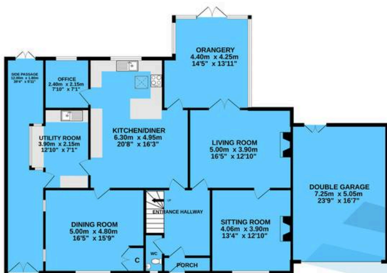
GROUND FLOOR 175.9 sq.m. (1893 sq.ft.) approx.