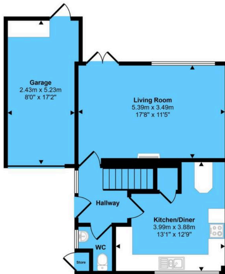
Ground Floor Approx 55 sq m / 588 sq ft

Approx Gross Internal Area 95 sq m / 1027 sq ft