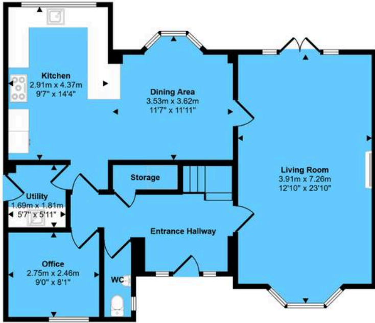
Ground Floor Approx 79 sq m / 852 sq ft

Approx Gross Internal Area 183 sq m / 1972 sq ft