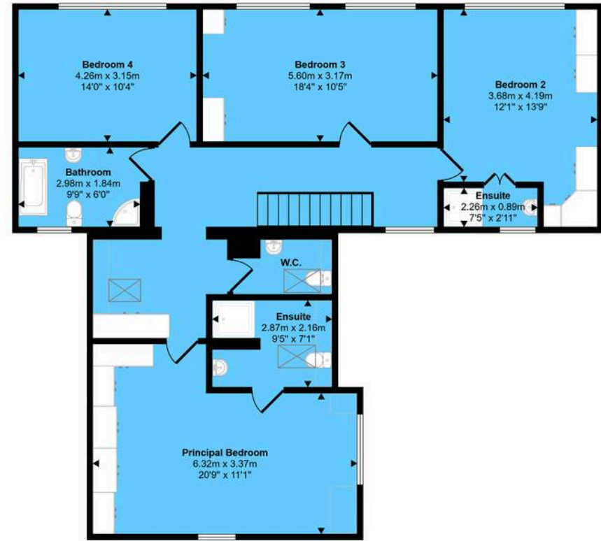
First Floor Approx 115 sq m / 1241 sq ft

This floorplan is only for illustrative purposes and is not to scale. Measurements of rooms, doors, windows, and any items are approximate and no responsibility is taken for any error, omission or mis-statement. Icons of items such as bathroom suites are representations only and may not look like the real items. Made with Made Snappy 360.