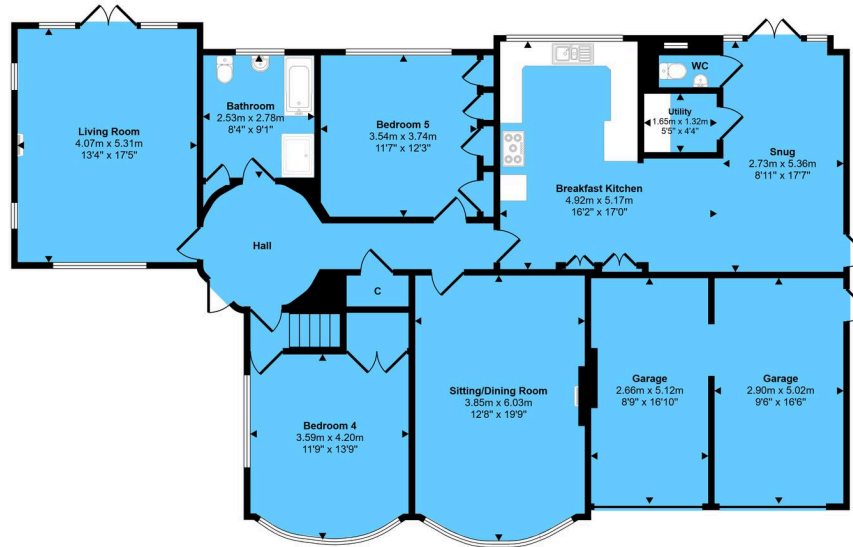
Ground Floor Approx 172 sq m / 1846 sq ft

Approx Gross Internal Area 253 sq m / 2723 sq ft