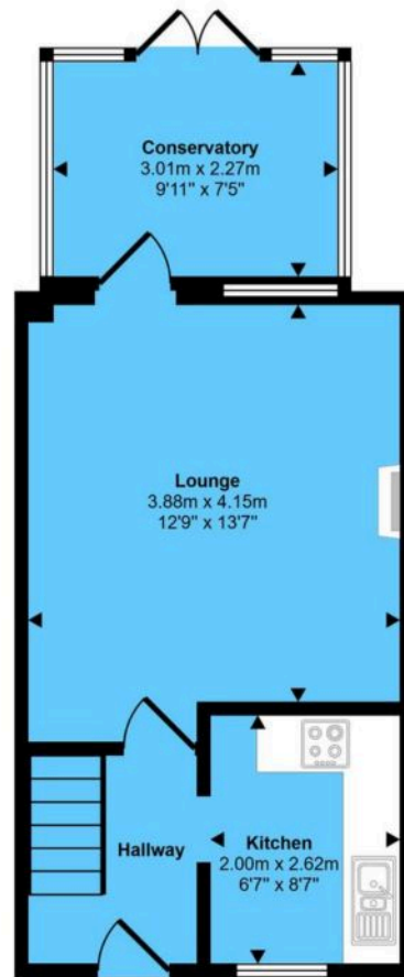
Ground Floor Approx 35 sq m / 377 sq ft

Approx Gross Internal Area 62 sq m / 671 sq ft