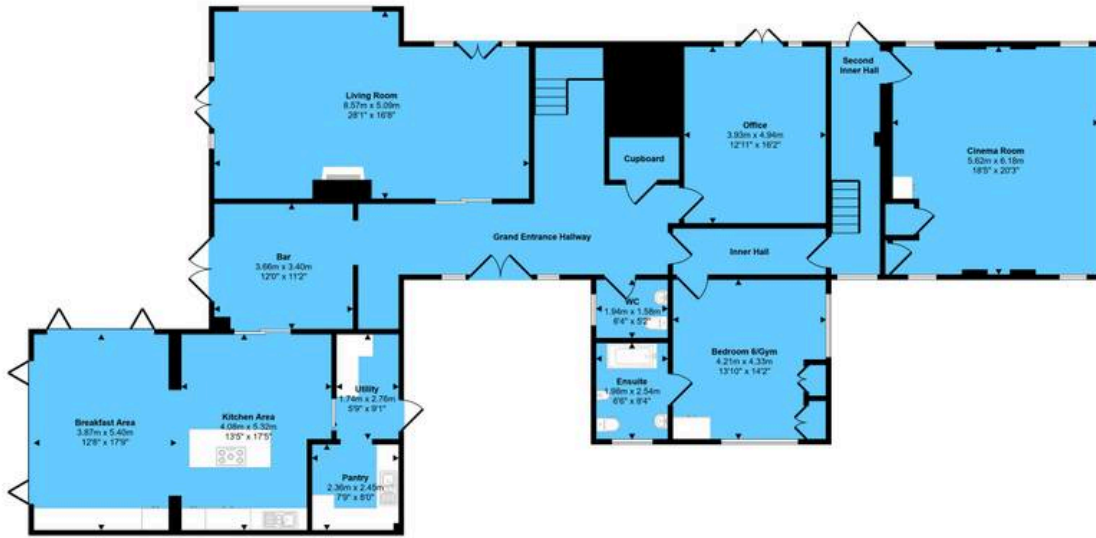
Ground Floor Approx 228 sq m / 2472 sq ft

Approx Gross Internal Area 418 sq m / 4487 sq ft