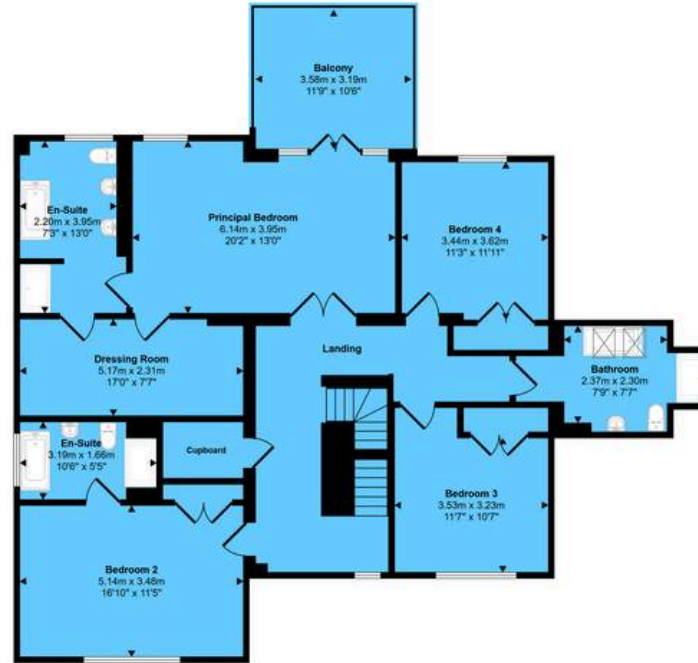
First Floor Approx 138 sq m / 1482 sq ft