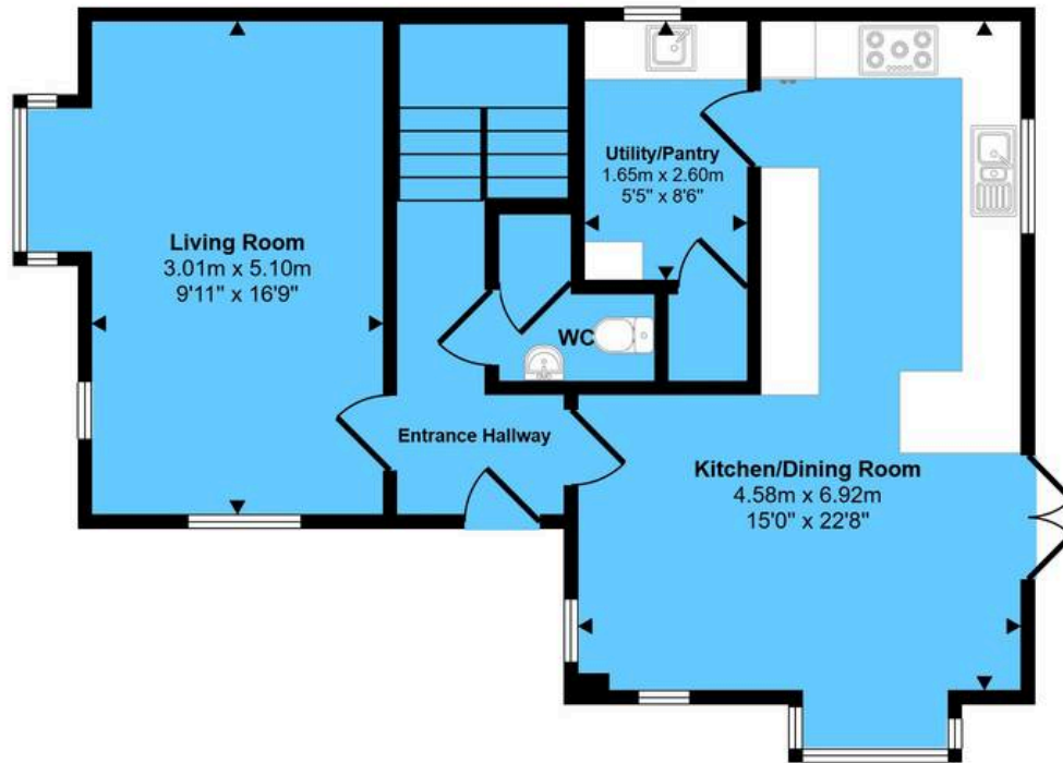
Ground Floor Approx 59 sq m / 637 sq ft

Approx Gross Internal Area 119 sq m / 1281 sq ft