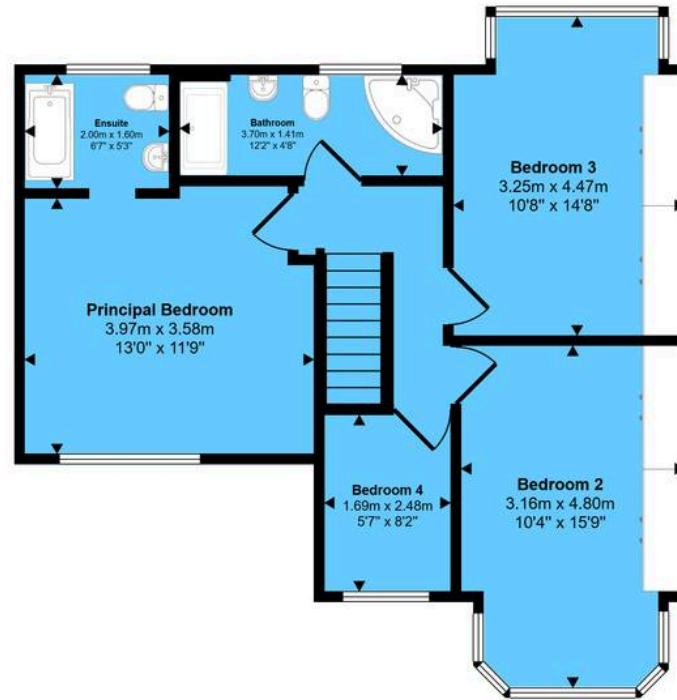
First Floor Approx 64 sq m / 688 sq ft