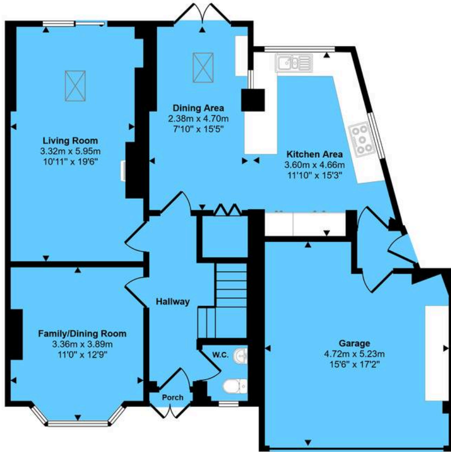
Ground Floor Approx 100 sq m / 1073 sq ft

Approx Gross Internal Area 183 sq m / 1965 sq ft