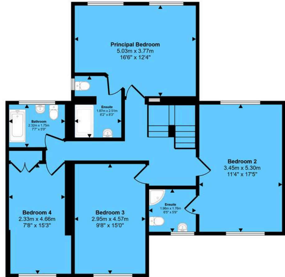
First Floor Approx 91 sq m / 984 sq ft

This floorplan is only for illustrative purposes and is not to scale. Measurements of rooms, doors, windows, and any items are approximate and no responsibility is taken for any error, omission or mis-statement. Icons of items such as bathroom suites are representations only and may not look like the real items. Made with Made Snappy 360.