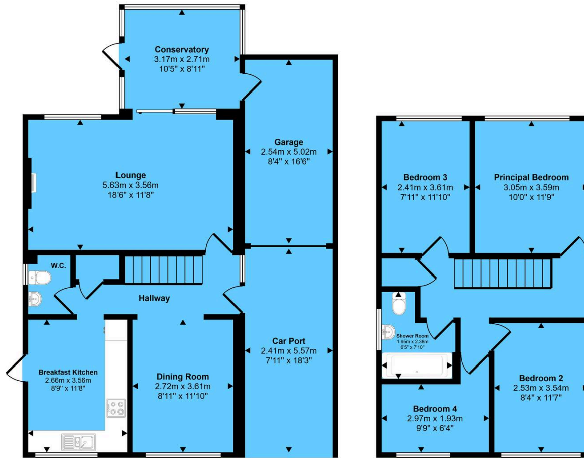
Ground Floor Approx 90 sq m / 965 sq ft

Approx Gross Internal Area 141 sq m / 1516 sq ft