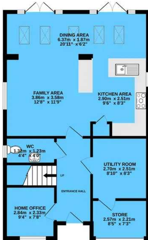
GROUND FLOOR 64.0 sq.m. (689 sq.ft.) approx.